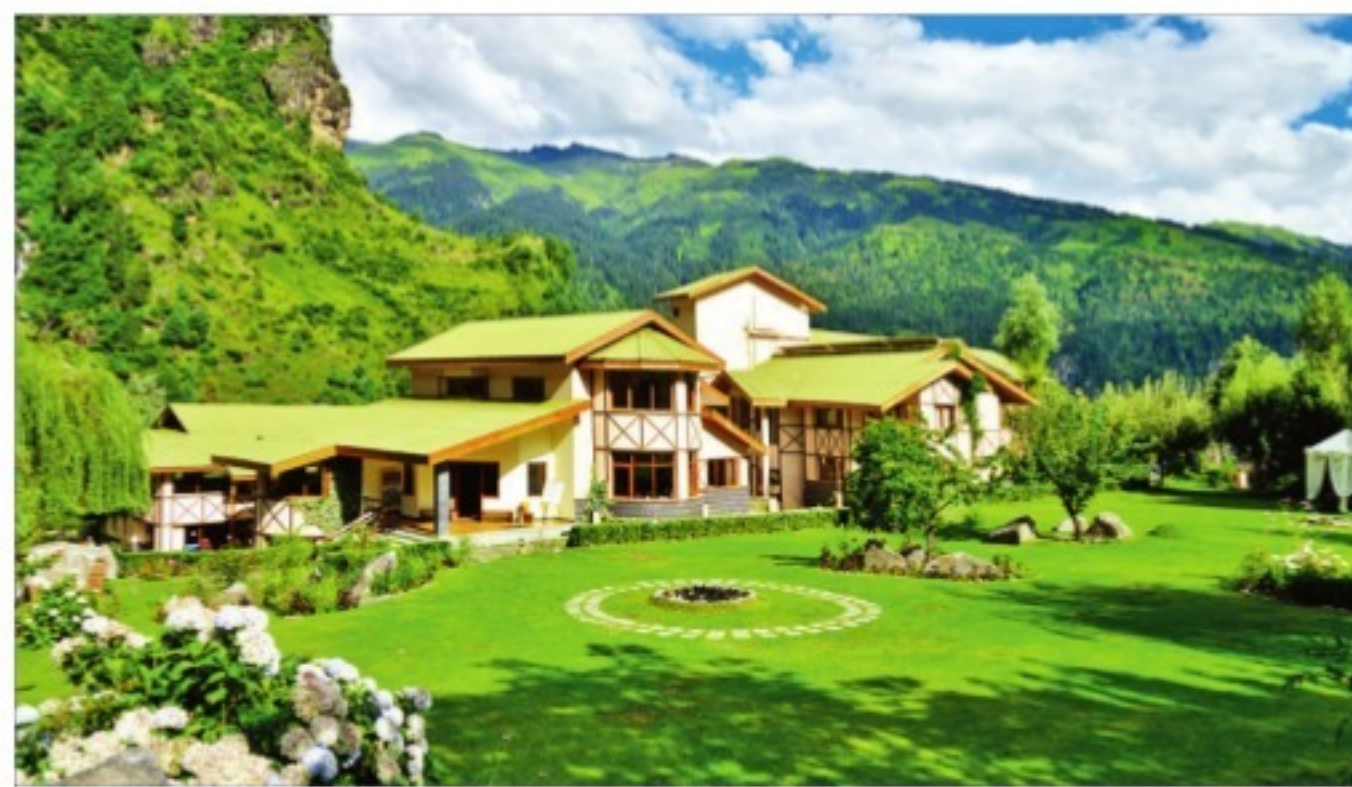
(Extreme left) Freshly caught trout with a side of mashed potatoes and veggies; (left) the Solang Valley Resort.

the rocks and glanced around — no plastic, no construction and lush greenery. I began to wish this was the end point. But we had miles to go. About 3.5 kms in, fatigue set in. So did hunger. We had reached Beas and just after crossing a small bridge made of tin sheets and logs, we dipped our faces in the cold glacial water and it worked wonders!